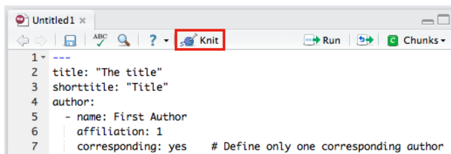
Figure 2. The Knit button in the RStudio.